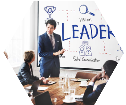
Proven IT Legacy