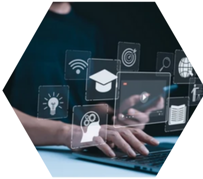
100% Practical Learning