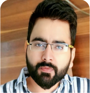
Vijay 15 LPA (Full Stack) CYBAGE