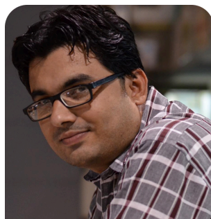
Arvind 6 LPA (SEO) Openxcell