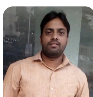
DhramVeer 4 LPA (Front-End) SIGNOX