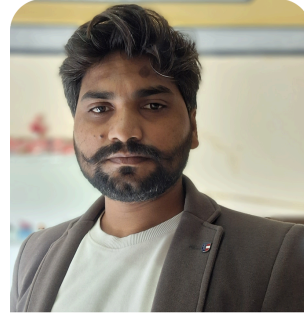
Murari 9 LPA (Front-End) iFLAIR